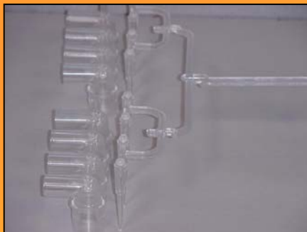
Left: A-Half of 16-cavity production tool.